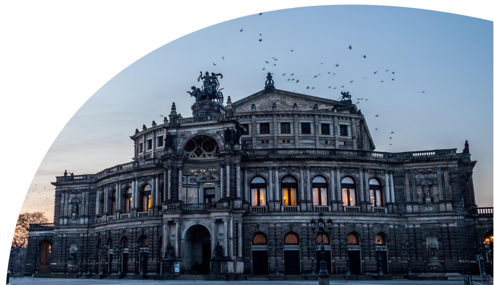
Semper Opera, Dresden