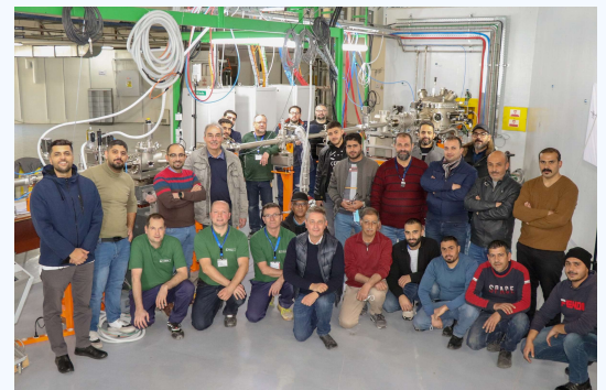
HESEB Installation Team